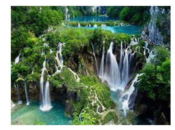
Plitvice Lakes National Park

Trip Insurance: The Springfield Ski and Travel Club strongly recommends at a minimum the purchase of trip insurance covering accident, sickness or death of a participant or covered family member that would result in cancellation either prior to or during the trip. Travelers are encouraged to purchase "Cancel for Any Reason" insurance if possible (be sure to compare coverage as some packages do not cover the full price of a trip). Your trip insurance should be purchased as soon as possible to ensure complete coverage.